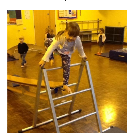
Safety Around the School